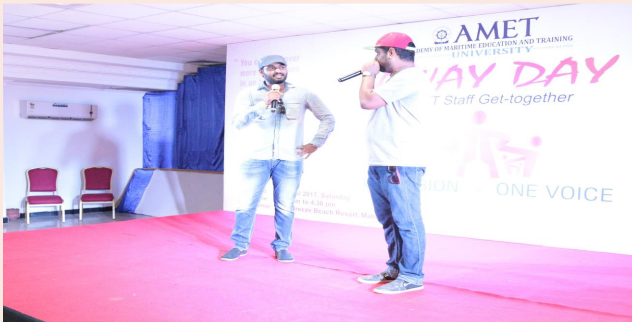
AWAY DAY – Director Project participation