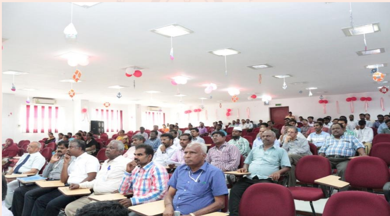
AMET Staff Participation