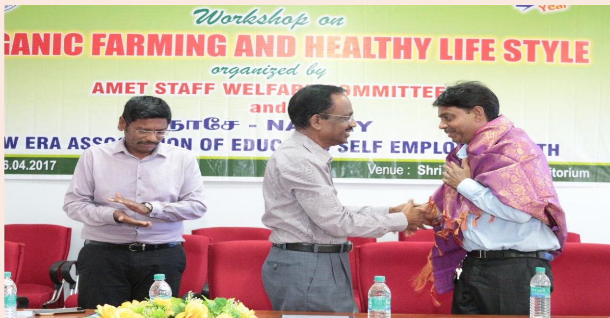
Hon' Vice-Chancellor Honoring the Guest