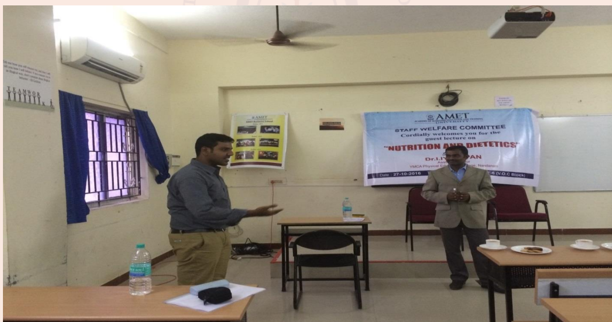
Nutrition and Dietetics Programme- Question Session