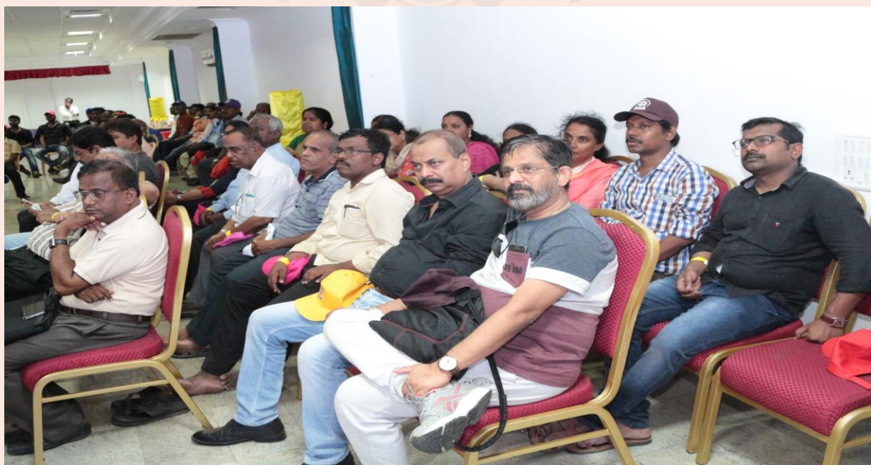
AWAY DAY – Staff Members