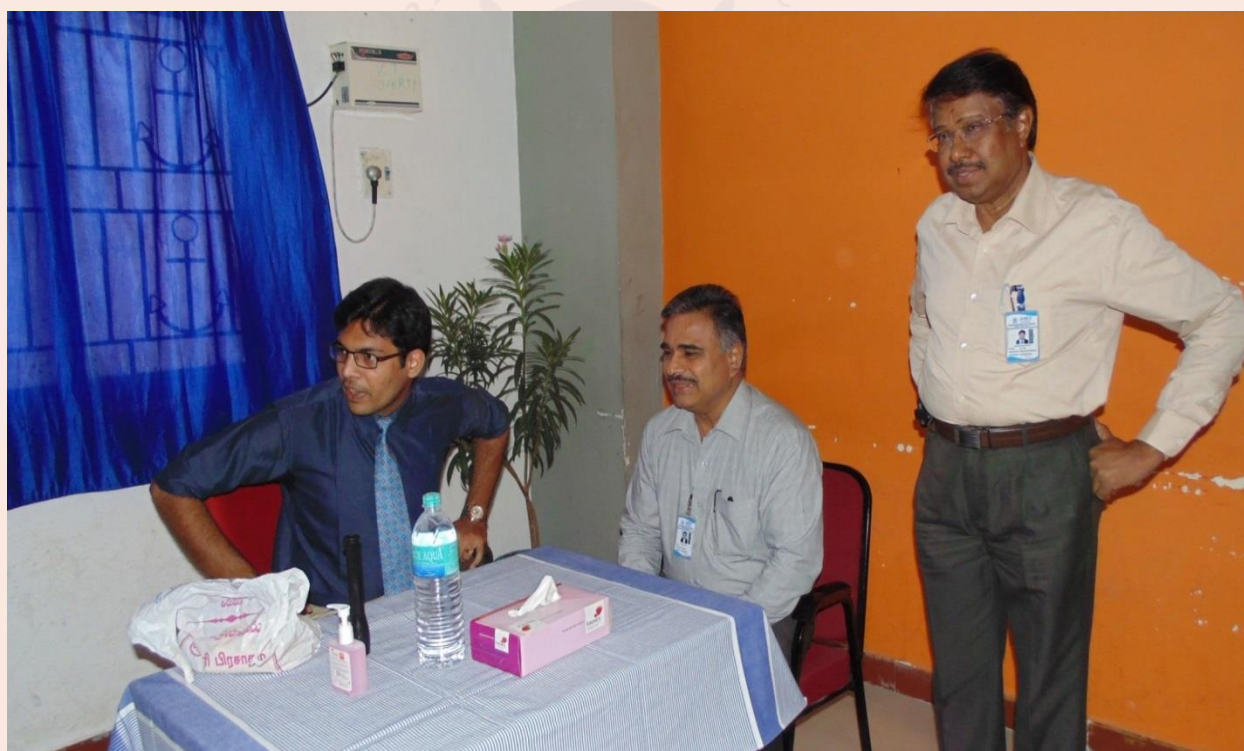
One day Free Dental Camp Photos