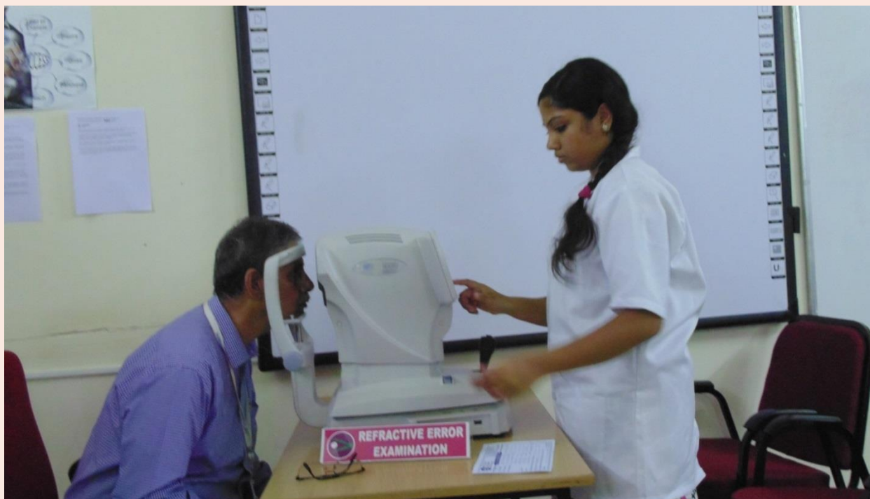
Refractive Error Screening Camp- photos