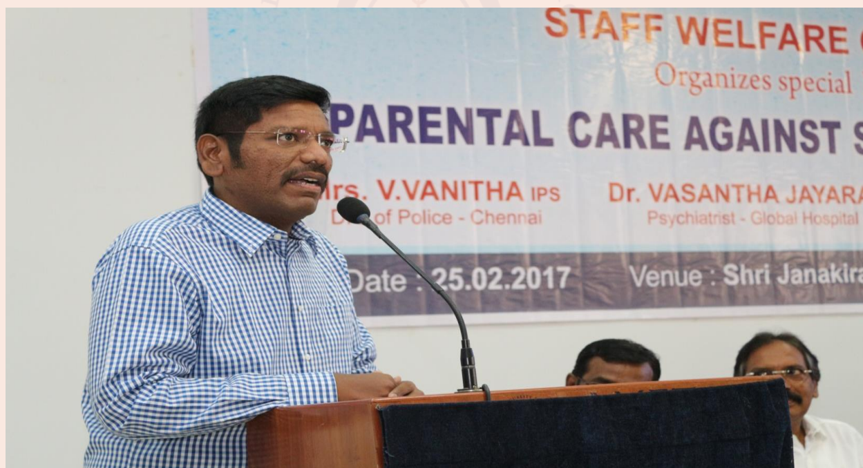
Keynote Address by Hon' Pro-Chancellor