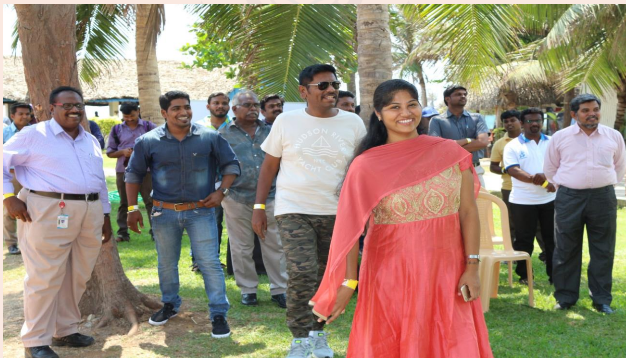
AWAY DAY –Our Admin Director in the event