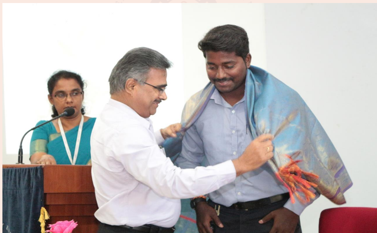
Registrar Honoring the Guest