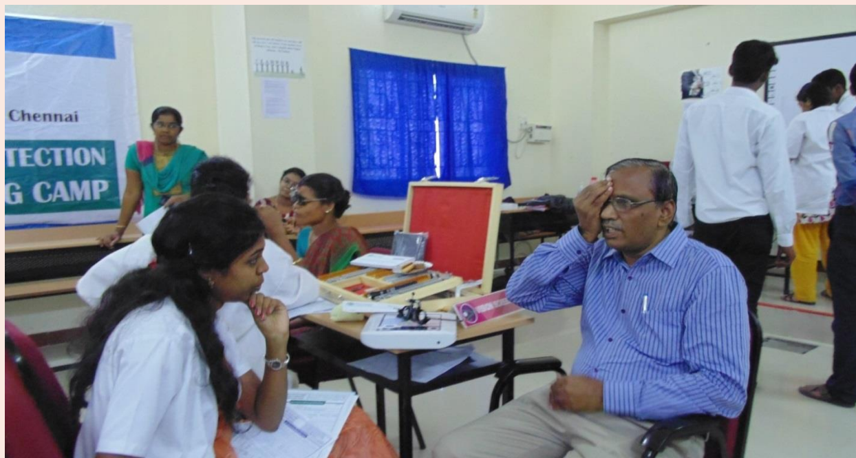
Refractive Error Screening Camp- photos