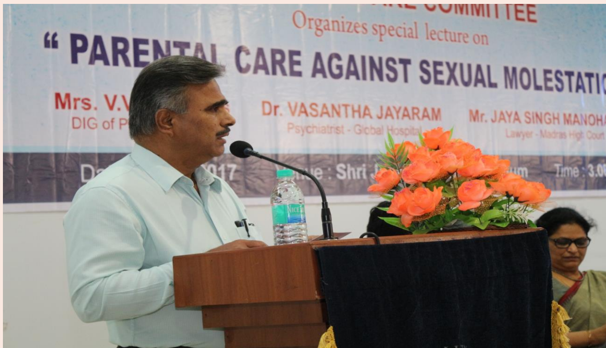
Welcome Address by Registrar