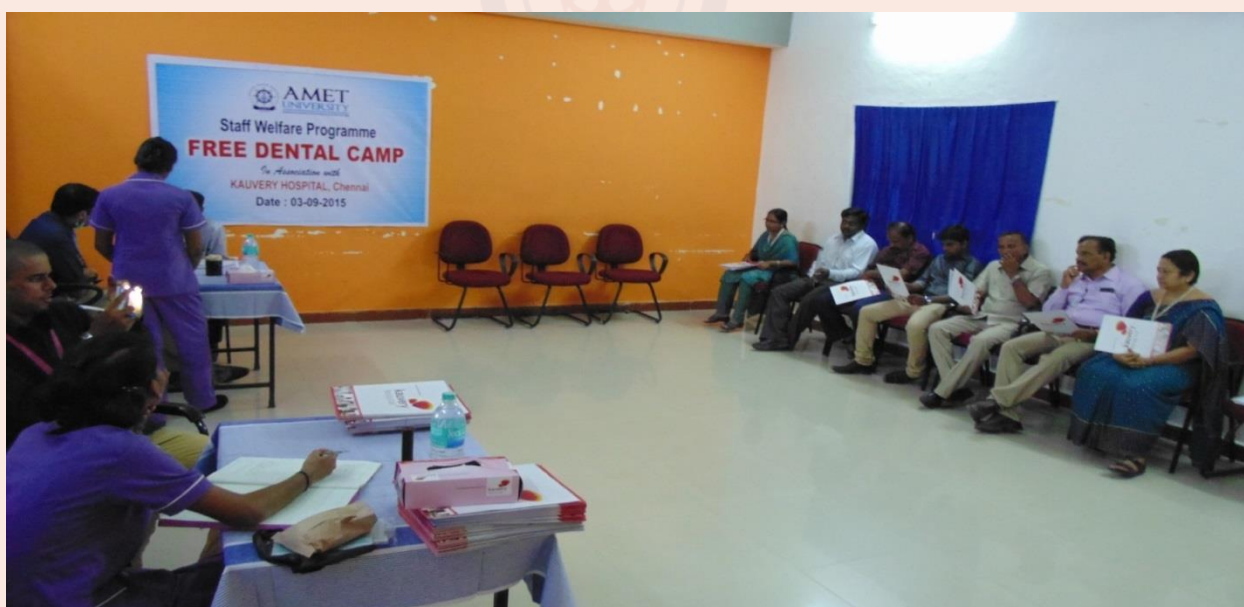
One day Free Dental Camp Photos