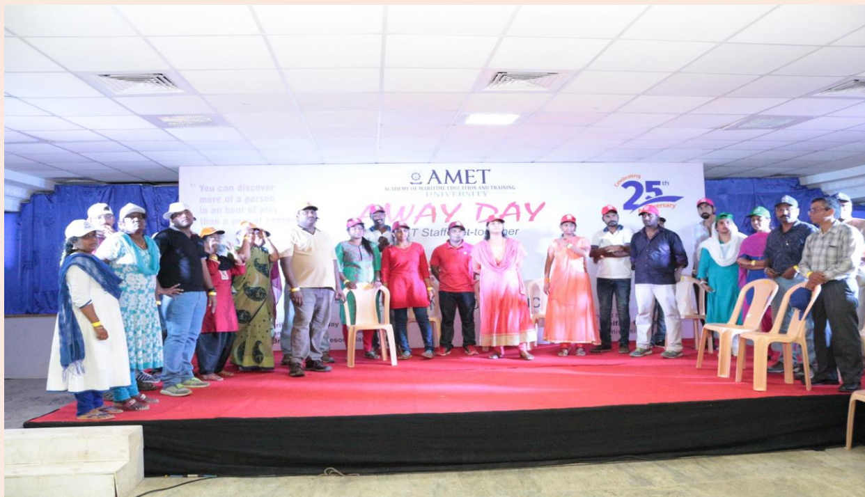
AWAY DAY- Staff Event