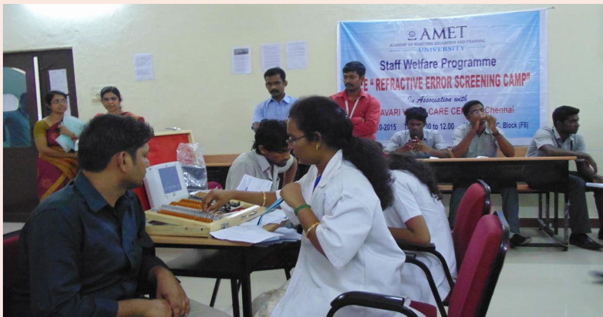
Refractive Error Screening Camp- photos