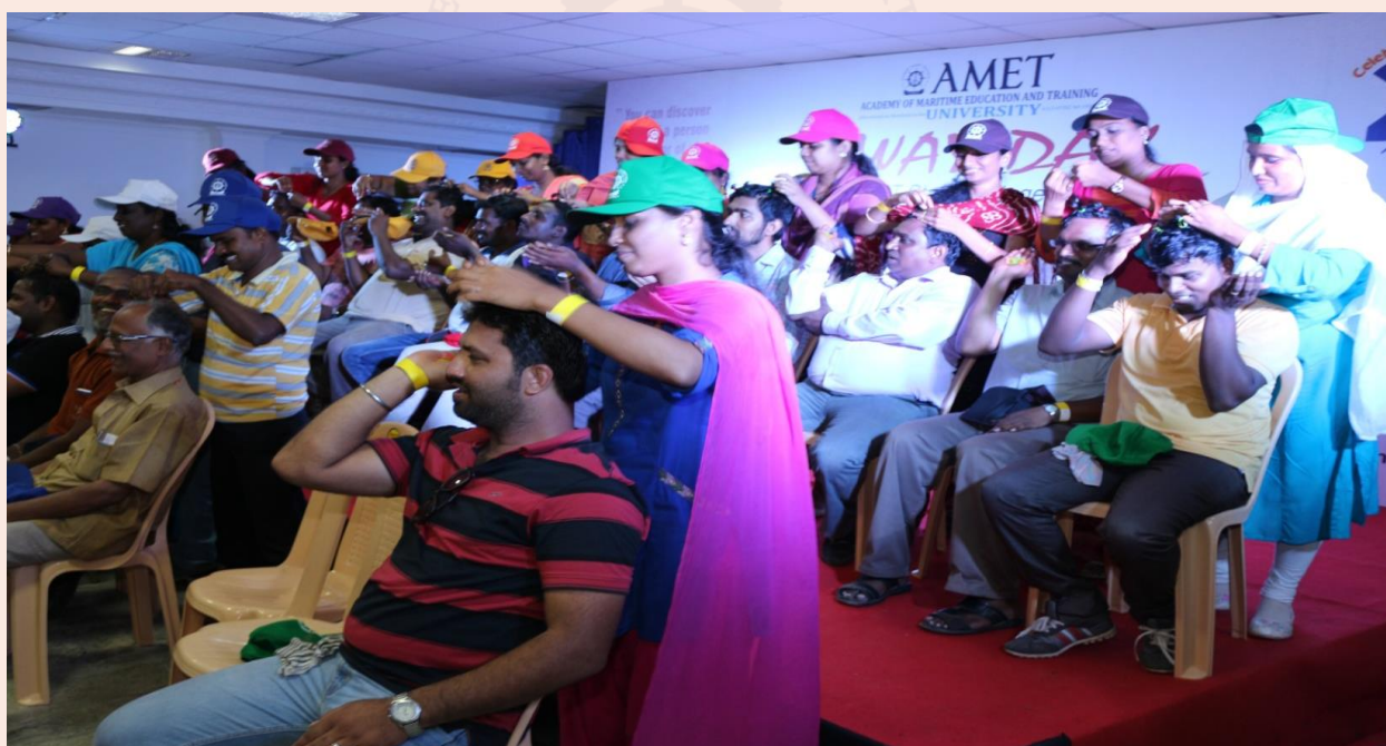
AWAY DAY- Team Building Event