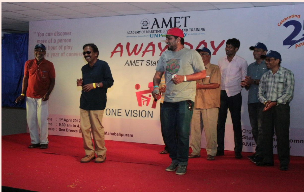
AWAY DAY- Managing Trustee involvement