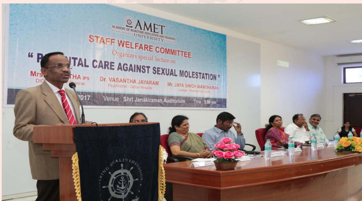
Presidential Address by Hon' Vice-Chancellor