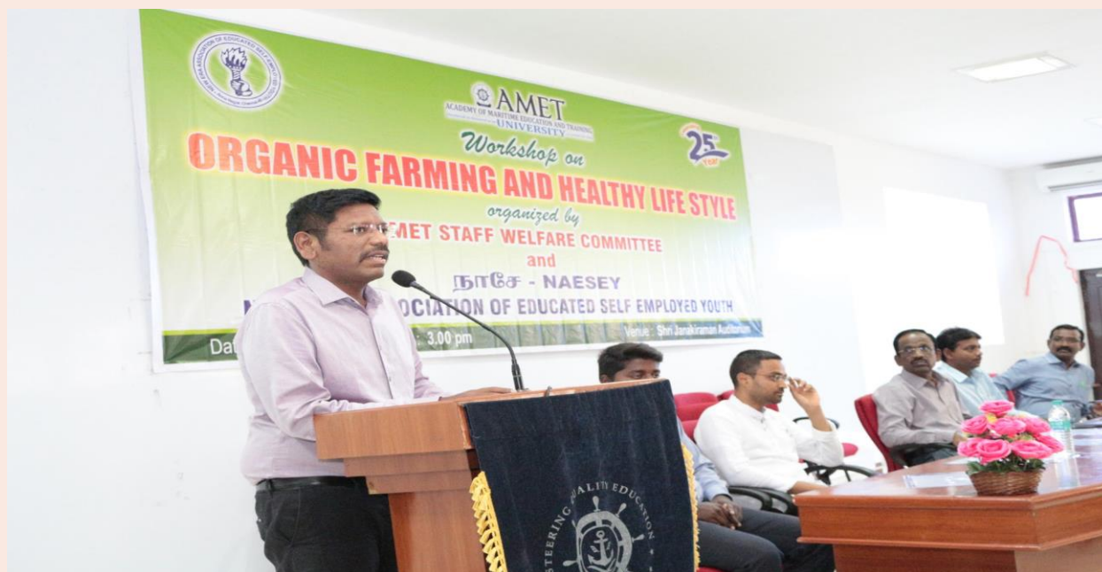
Inaugural Address by Hon' Pro-Chancellor