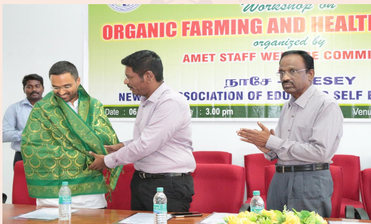
Pro-Chancellor Honoring the Guest