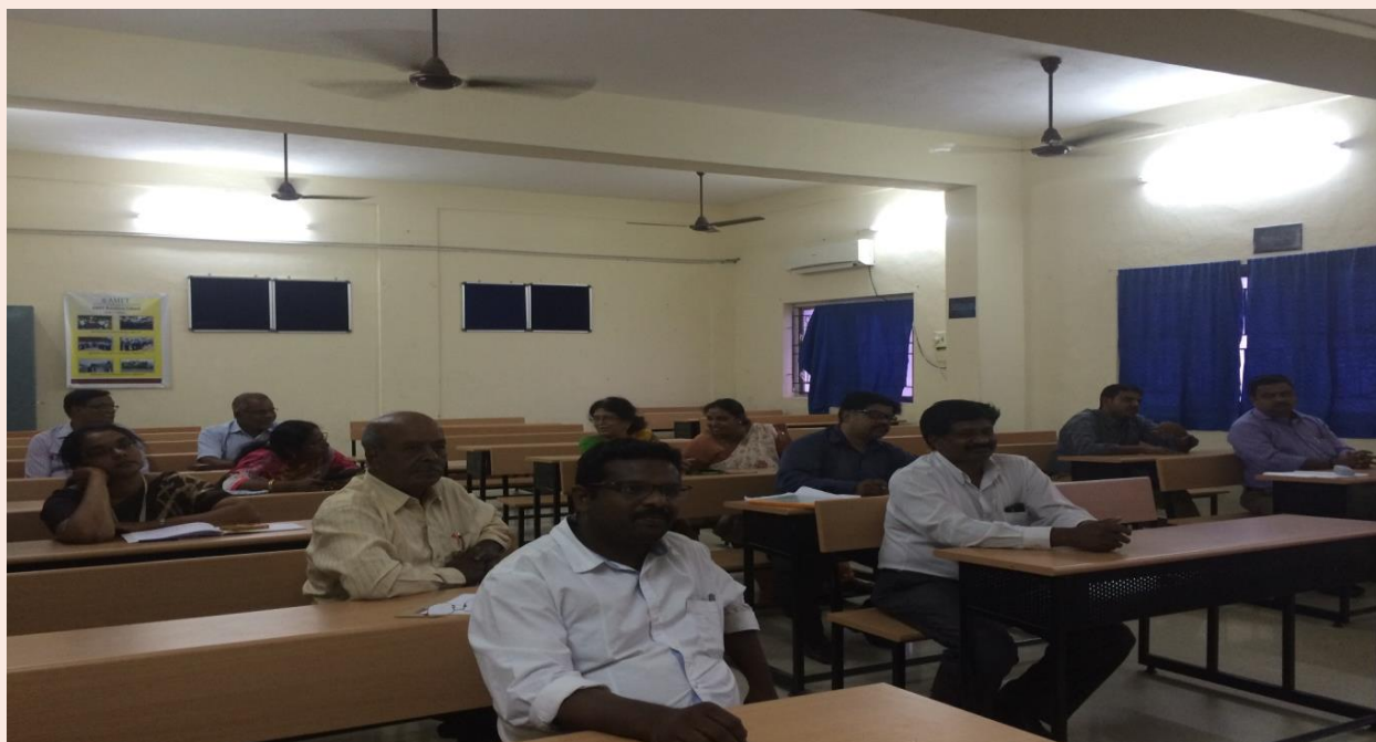
Nutrition and Dietetics Programme-Photos