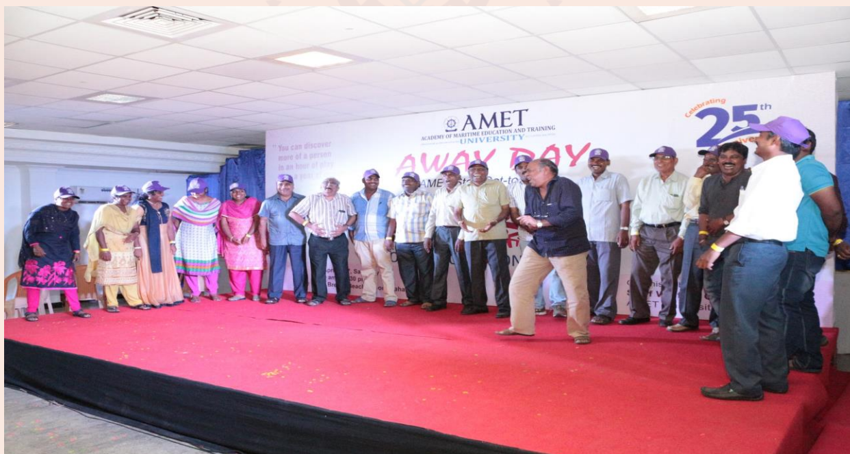
AWAY DAY- Staff Roleplay