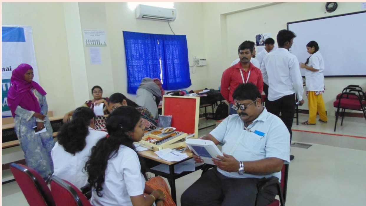
Refractive Error Screening Camp- photos