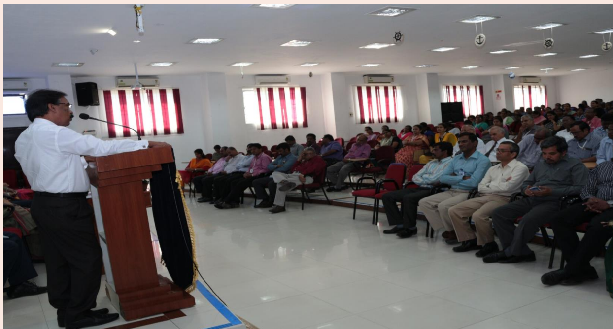
Inaugural Address by Managing Trustee