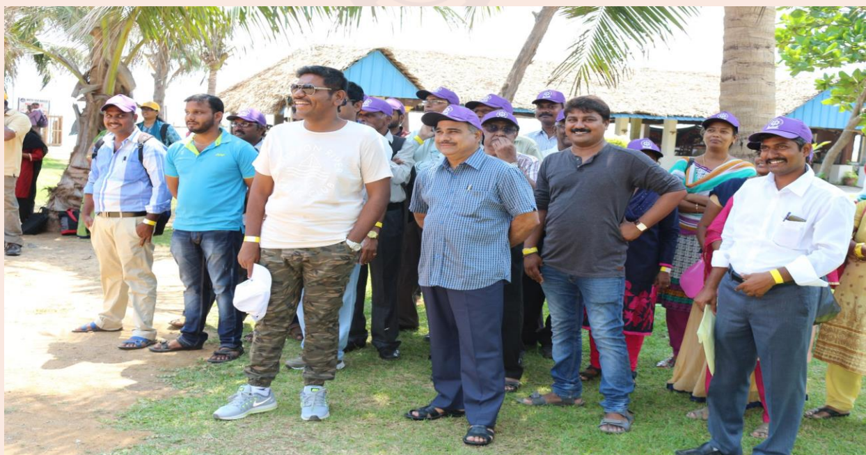
AWAY DAY- Hon' Pro-Chancellor and Staff members