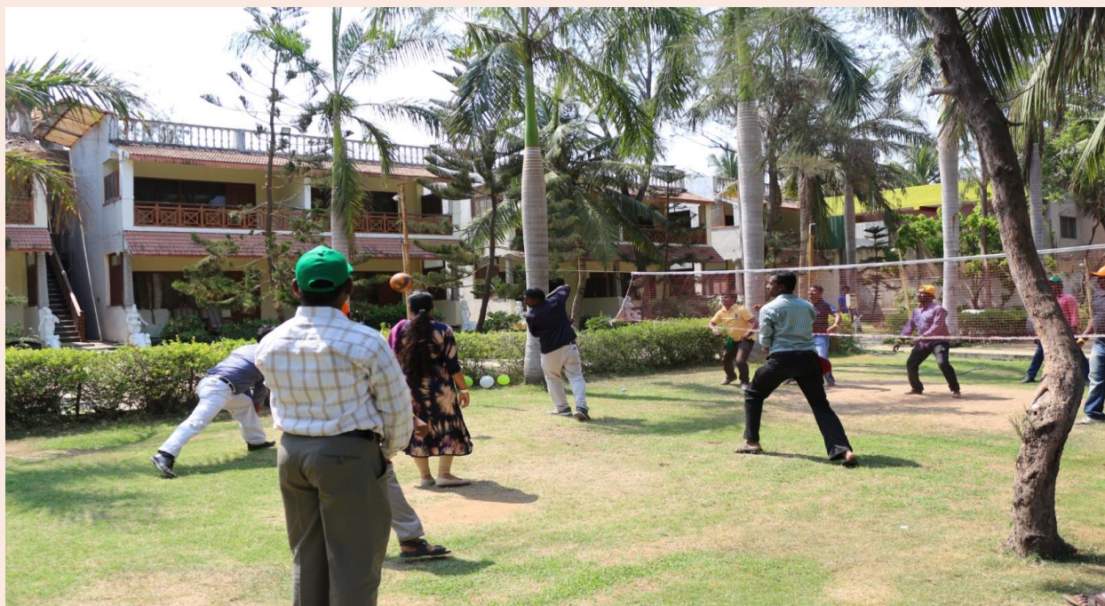
AWAY DAY- Staff Games