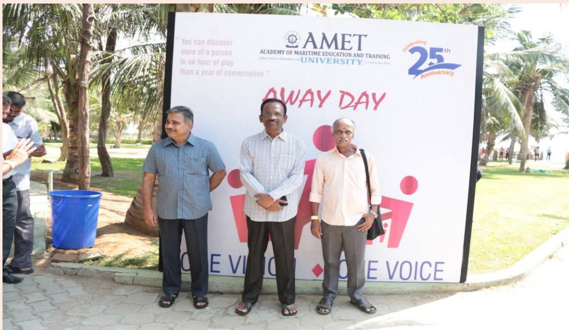
AWAY DAY – Hon' Vice-Chancellor and Registrar in the Venue

4.30pm. After having the hi-tea, all AMET Staff members returned to the respective places by using AMET University Transport.