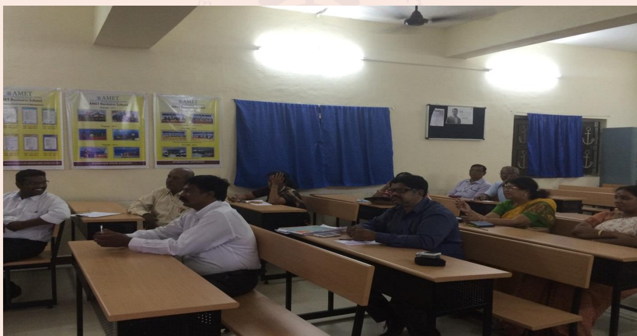
Nutrition and Dietetics Programme-Photos